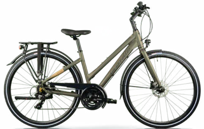
Art. No.: 291541