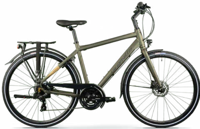
Art. No.: 291542